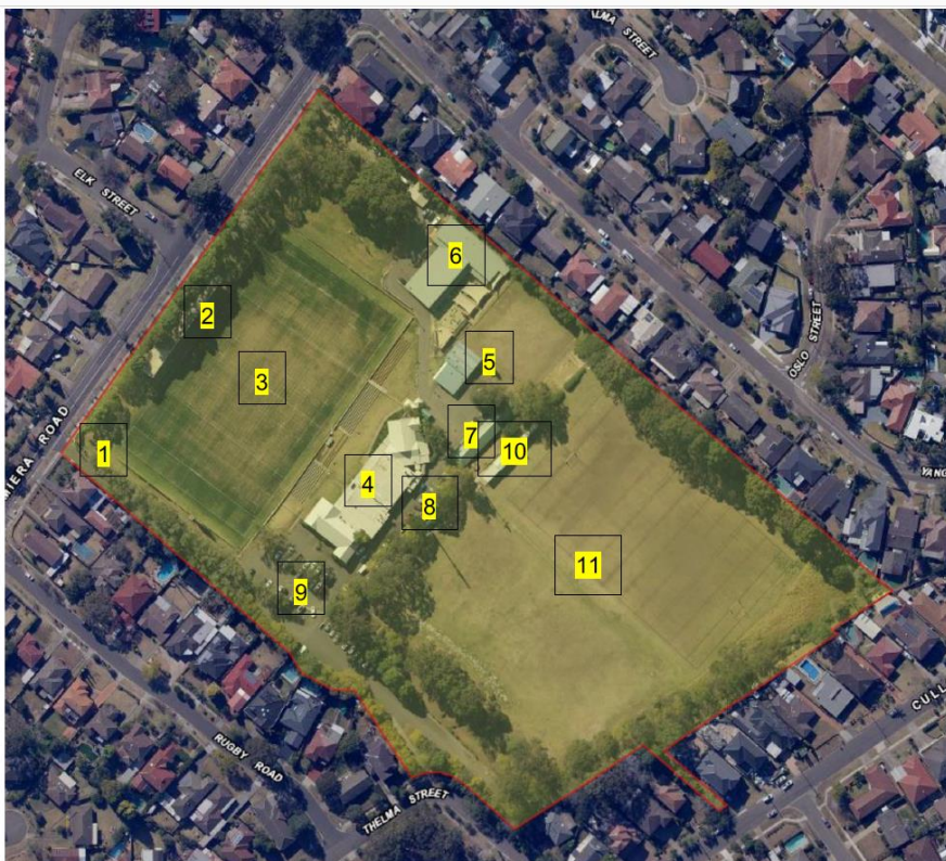
Figure 14: TG Millner Field facilities