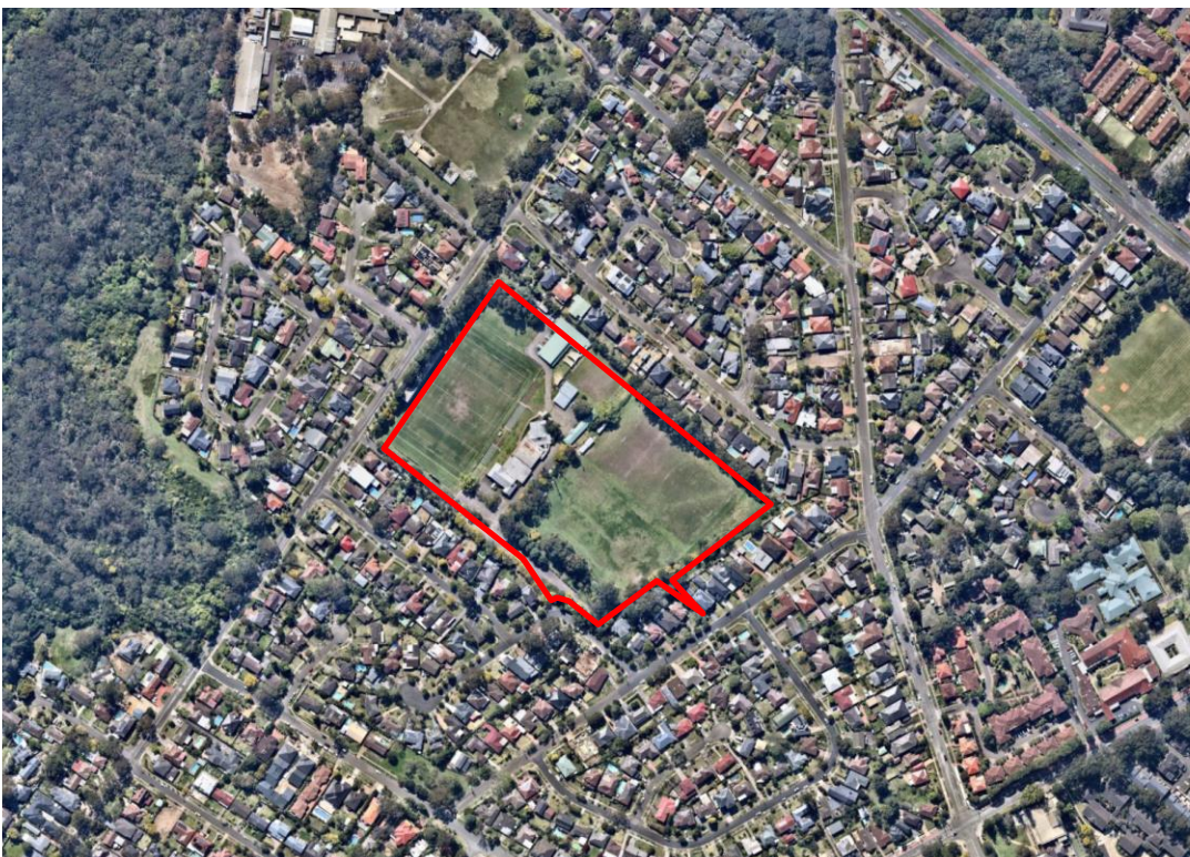
Figure 1: Aerial Image of the site and immediate surrounds.

The Planning Proposal site (Lot 6 in DP 1046532) is known as the TG Millner playing fields at 146 Vimiera Road, Marsfield. The site is surrounded by existing residential development as shown in figure 1.