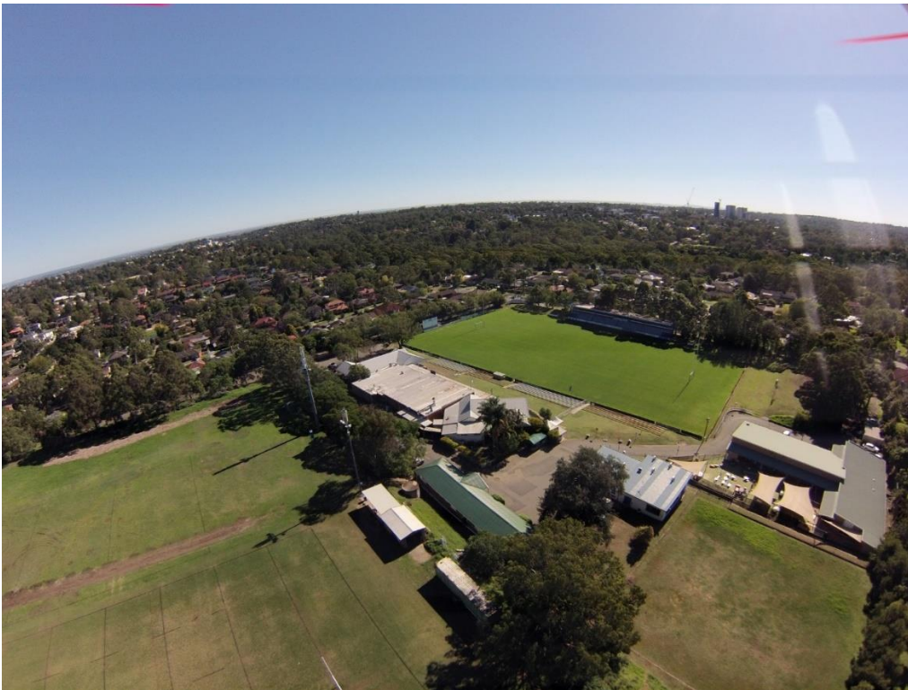
Figure 2: TG Millner layout and facilities

The Site is currently occupied by Eastwood Rugby Club, the North Ryde RSL Sports Club and a 78-place childcare centre. Existing site comprises the TG Millner Field (see Figure 2 and Figure 3 for the existing playing field facilities at the subject site), a district-grade playing field with grandstand seating, and a range of associated structures used by Eastwood Rugby Club. A large informal rugby training area is located in the south-eastern portion of the Site. The NRRSL Sports Club, a registered club which includes bar, bistro and gaming facilities, is located in the centre of the Site adjacent to the TG Millner Field. The childcare centre is located on a portion of the site under lease adjacent to the northern boundary near Vimiera Road.